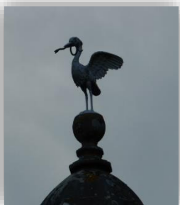
Heron on top of the clock tower at Arlington Court

The symbol of the heron from the Chichester coat of arms can still be seen above the door from our roots back in 1830 and remains our symbol today. We are proud of our heritage and the link to the Chichester family. The Heron remains a prominent symbol for many places in the local area and serves to underline our commitment to local environmental education.