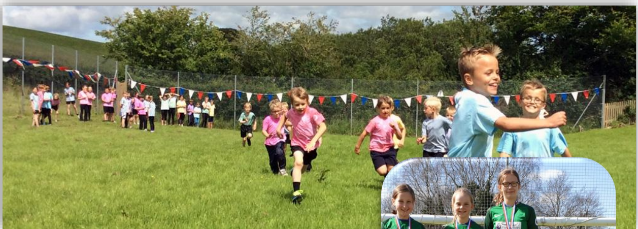
North Devon Girls Football Champions (2019)

Despite being a small school we take competitive sport seriously. Since 2014 we have achieved notable sporting success: