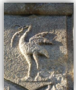
Heron pictured on the original school door frame

The symbol of the heron from the Chichester coat of arms can still be seen above the door from our roots back in 1830 and remains our symbol today. We are proud of our heritage and the link to the Chichester family. The Heron remains a prominent symbol for many places in the local area and serves to underline our commitment to local environmental education.