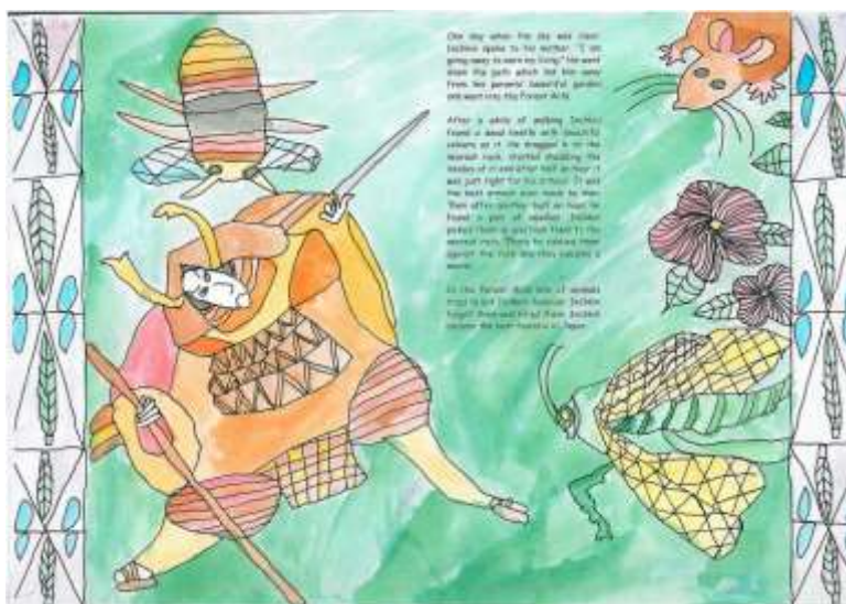
Japanese influenced writing and art

We work closely with parents to help children become independent and confident readers to help ensure life-long learning.