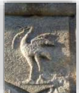
Heron pictured on the original school door frame

The symbol of the heron from the Chichester coat of arms can still be seen above the door from our roots back in 1830 and remains our symbol today. We are proud of our heritage and the link to the Chichester family. The Heron remains a prominent symbol for many places in the local area and serves to underline our commitment to local environmental education.