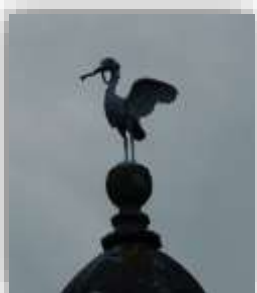
Heron on top of the clock tower at Arlington Court

The symbol of the heron from the Chichester coat of arms can still be seen above the door from our roots back in 1830 and remains our symbol today. We are proud of our heritage and the link to the Chichester family. The Heron remains a prominent symbol for many places in the local area and serves to underline our commitment to local environmental education.