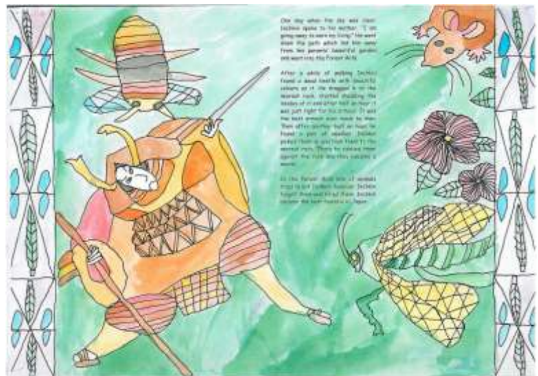
Japanese influenced writing and art

We work closely with parents to help children become independent and confident readers to help ensure life-long learning.