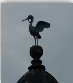
Heron on top of the clock tower at Arlington Court

The symbol of the heron from the Chichester coat of arms can still be seen above the door from our roots back in 1830 and remains our symbol today. We are proud of our heritage and the link to the Chichester family. The Heron remains a prominent symbol for many places in the local area and serves to underline our commitment to local environmental education.