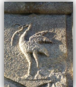
Heron pictured on the original school door frame